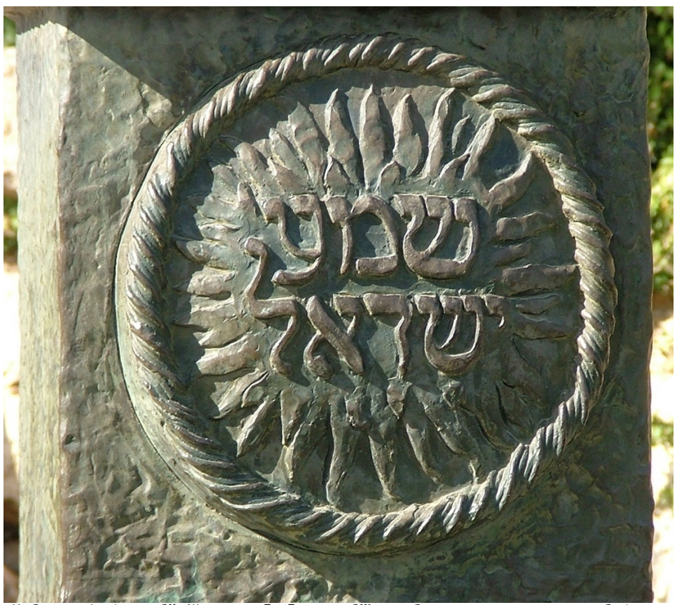
Figure 1. "Shema' Yisrael" ("Hear, [O] Israel") at the Knesset Menorah in Jerusalem2

An Old Testament KnoWhy1 relating to the reading assignment for Gospel Doctrine Lesson 17: "Beware Lest Thou Forget" (Deuteronomy 6; 8; 11; 32) (JBOTL17A)