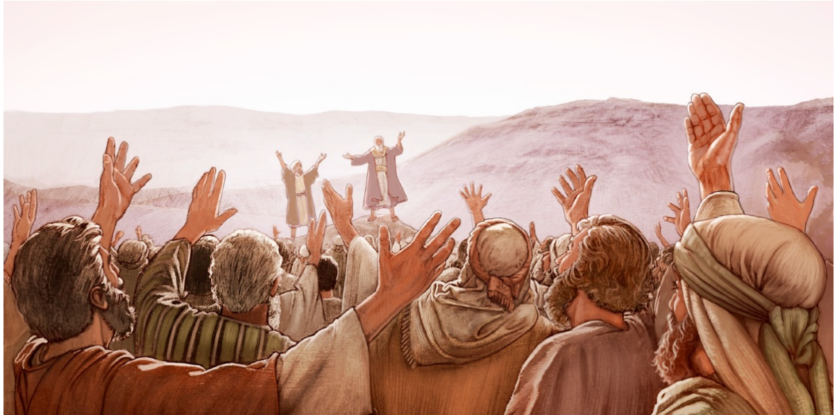
Figure 2. Moses delivering his "valedictory address" 16

Below, we study the key terms in Deuteronomy 6:5 — and in its prologue in verse 4 — one by one. But first, we will take a brief look at the context in which these two verses appear.