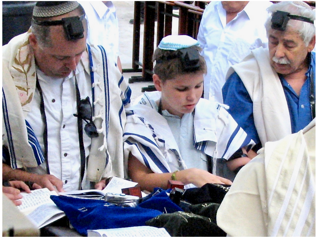
Figure 4. Bar Mitzvah at the Western Wall in Jerusalem76